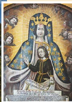
Below the church, there is the pilgrimage chapel of Our Lady of Klatovy called Grantl.